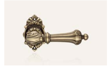
patiné patiné mat PM