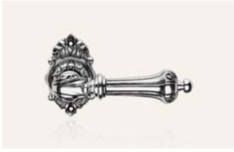
nero francese french black NF