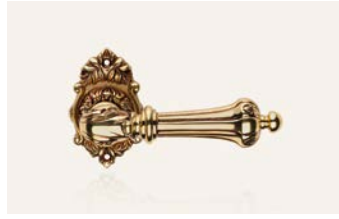
oro francese french gold OF