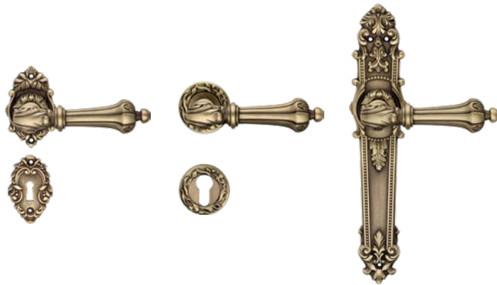
1590 RB 008