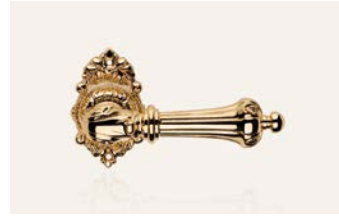
oro zecchino gold plated OZ